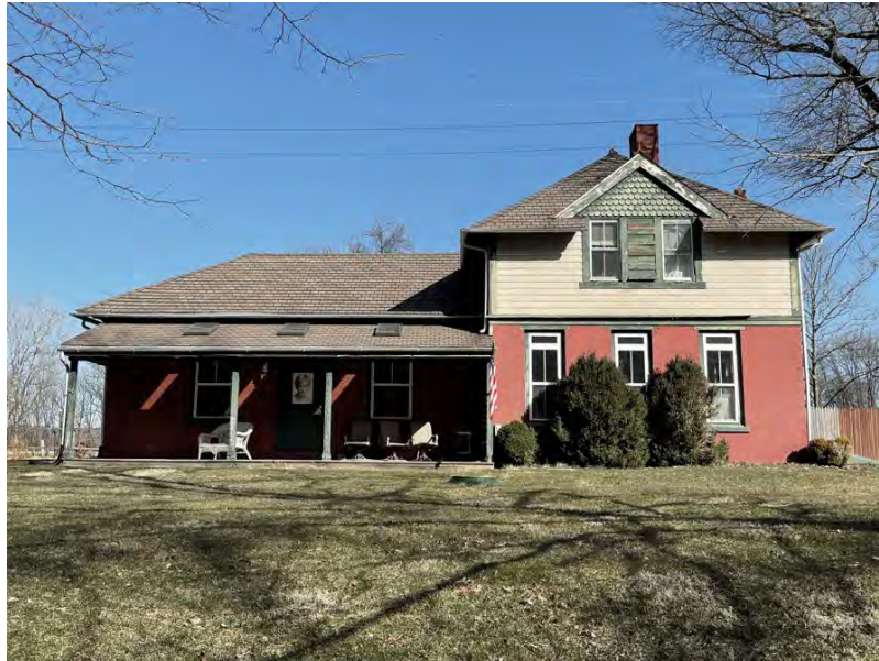
Glen Loch Station (023) built c. 1890 (Commonwealth 2021).