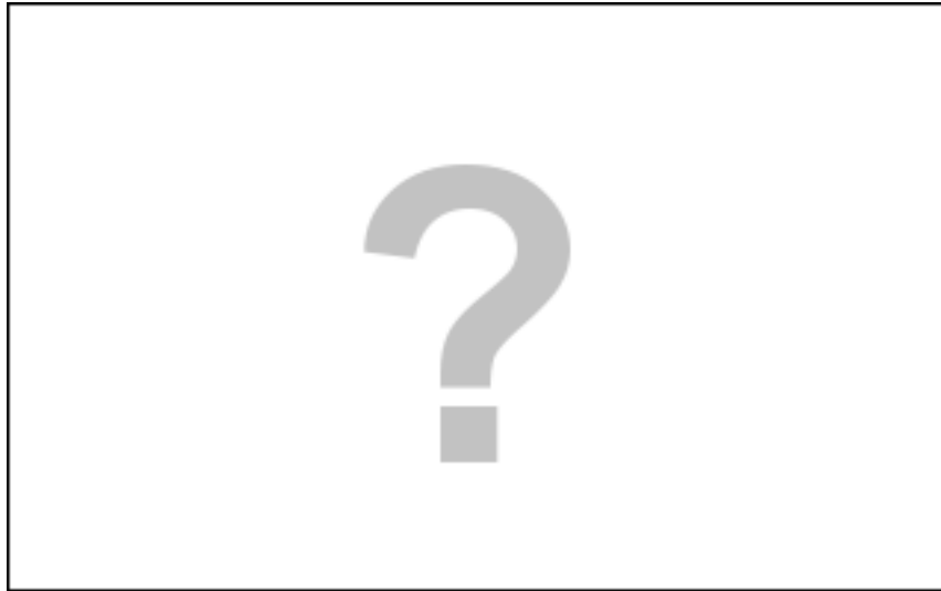
Zook House/Owen House (305). Home to eight generations of the Zook family.