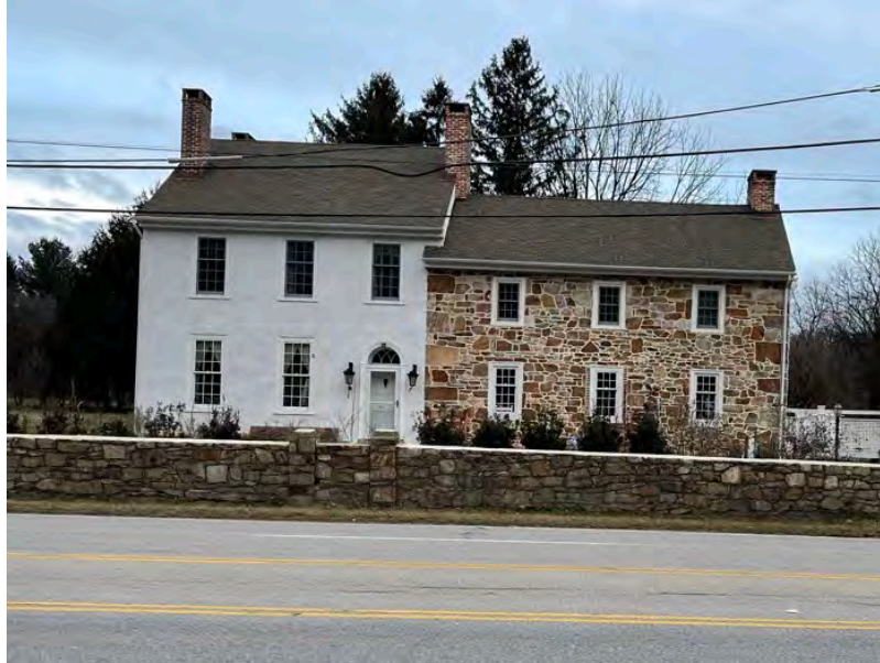
The West Whiteland Inn (226) (Commonwealth 2021).