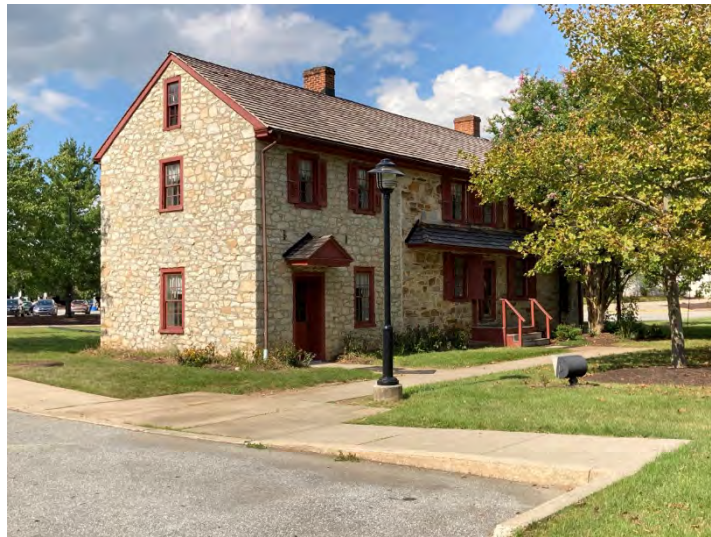
Zook House (305). Former headquarters of the West Whiteland Historical Commission (Commonwealth 2020).

Commonwealth Heritage Group, Inc. (Commonwealth), under the direction of the West Whiteland Historical Commission, revisited every historic resource listed on the Township's Historic Resources Map, and produced updated photographs and survey forms for each property where possible. Additionally, survey data was recorded and organized into a geodatabase allowing future updates to survey information to be seamlessly integrated into the data structure thereby eliminating static paper forms. The survey update also revealed and recorded over 400 historic buildings, structures, and archaeological sites related to the vibrant history and development of West Whiteland. The survey was further updated by inventorying select buildings constructed between 1930-1972, which were not 50-years old at the time of the initial 1982 survey, but since that time have continued to describe the development patterns and history of the Township. The updated survey information has been integrated into this book honoring its original format.