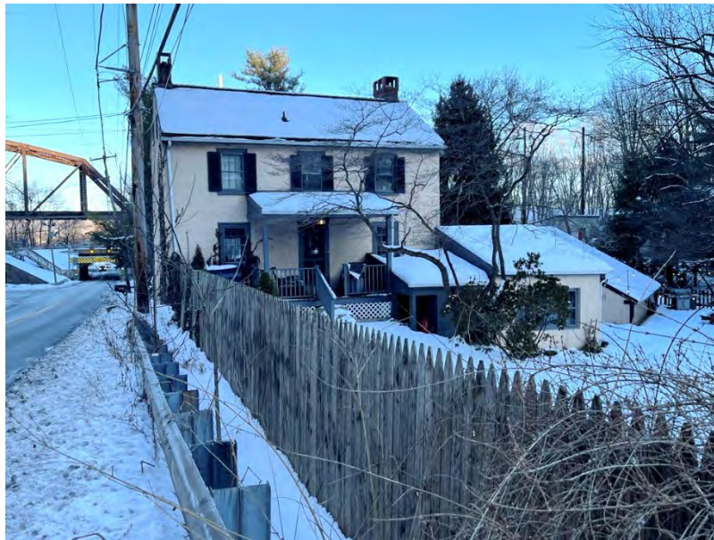
House at Whitford Station (130). An early 19 th century tradesman's house in Oakland (Commonwealth 2021).

Blacksmiths and wheelwrights tended to congregate in the Township's small villages, such as Grove ( 150 ), Oakland ( 128, 130, 132 ) and Exton ( 308 ). They were modest but steady trades, never employing more than two helpers, and frequently were practiced by father and son. In an average year, a wheelwright might produce between 6 and 9 wagons in addition to other work. Shoemaking was a similarly vital cottage industry throughout most of the 19th century; each shoemaker made as many as 200 pairs of boots and/or shoes annually. The number of persons listed as shoemakers in the 1850 Census stood at 10, a total exceeded only by farmers (of which there were 144) and laborers (of where there were 72) as the highest concentration of individuals in a single occupation.