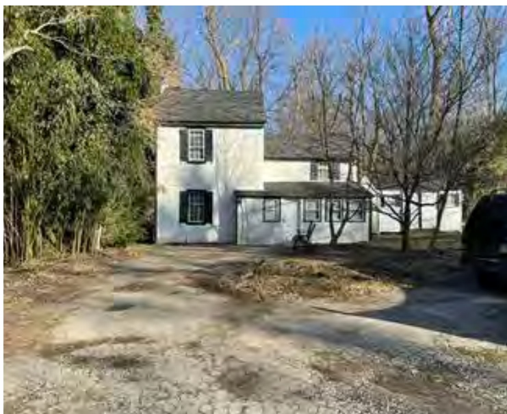
Halfway House (011). Built in 1833 by the West Chester Railroad Company (Commonwealth 2021).

The Pennsylvania Railroad Company acquired the Columbia in 1851, and one year later it began to lease the West Chester branch. The company built Railroad Rowhouses (014) , a group of duplexes, for its workers in 1872 on land along King Road between the two lines. Two stations, Woodland/Morstein (003) and Kirkland (053) , were constructed on the West Chester branch by 1873. Despite these improvements, the poor condition of the "Pan Handle Railroad" prompted this observation in the Daily Local News in 1876: