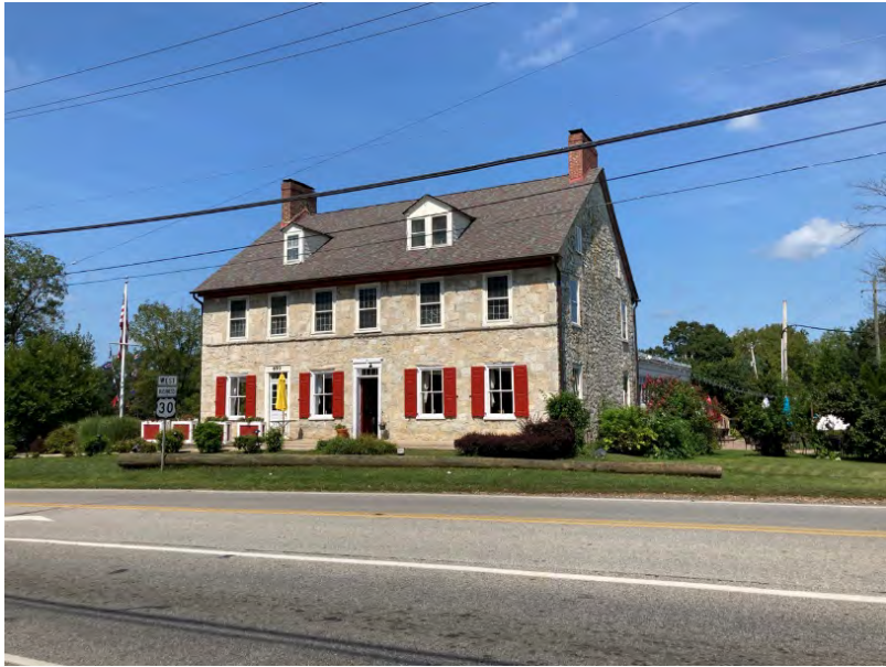
The Ship Inn (311). Built in 1796 by John Bowen in response to completion of the Lancaster Turnpike (Commonwealth 2021).

the road; by 1880, a stretch of the Turnpike east of its intersection with Route 100 was abandoned.