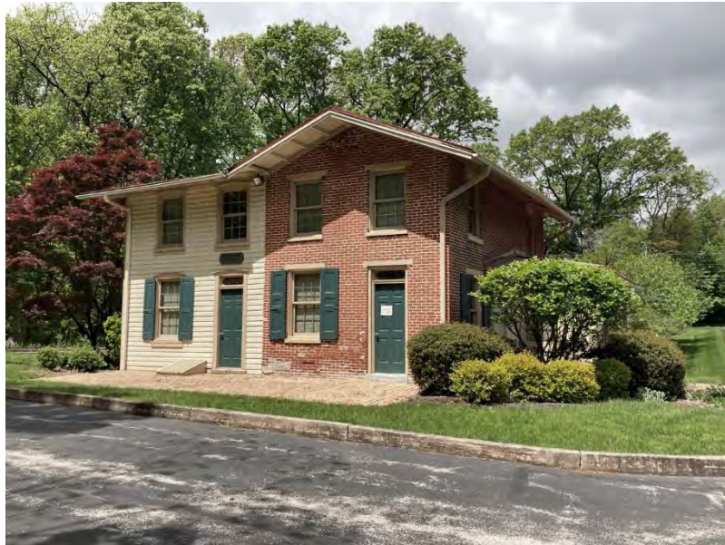
Woodland Station/Morstein Station built c. 1870 (003) (Commonwealth 2021).