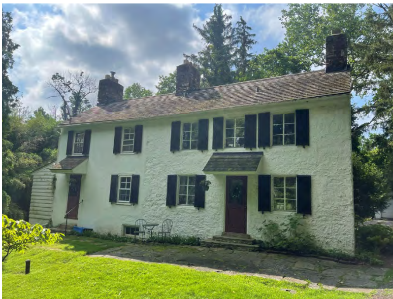
Wee Grimmet (123) constructed c. 1820 as a worker's cottage for a local quarrying and limekiln operation (Commonwealth 2021).

While marble was the Township's pride, limestone was its bread and butter. The Chester Valley was well endowed with limestone which was quarried for building stone or burned to produce lime for use in mortar and whitewash and as a soil supplement. Limestone quarries of all sizes were opened in the Township; one continues to be worked to this day by Exton Materials. Although usually associated with quarries, kilns were constructed on farms large and small throughout the Valley. Some were used solely by the farmer and adjoining landowners; by 1840, others were being leased to quarrymen for commercial exploitation. Several small stone houses occupied originally by quarry workers remain in the Township, close to the sites of old quarries and kilns ( 103.01, 103.02, 114.01, 123.01 ). Most of the kilns themselves, low structures banked into the earth, were abandoned by 1890 and left few perceptible traces.