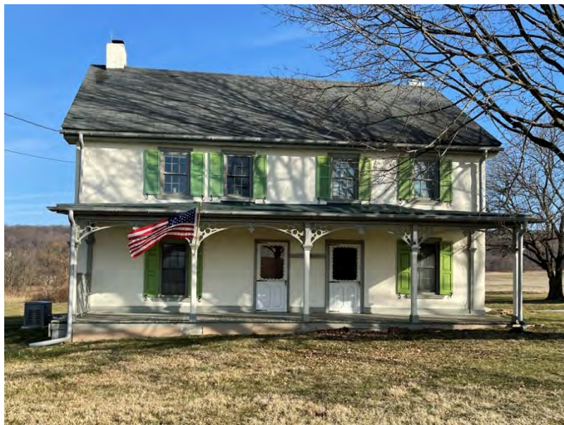
Fox Chase Inn (325) the Township's first licensed public house, built c. 1765 (Commonwealth 2021).