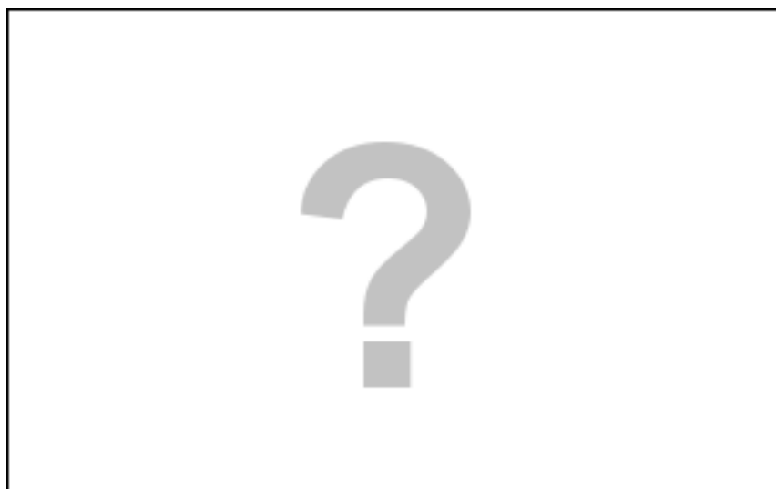
Whitford School (209). Most modern of the one room school houses. Photograph c. 1949.

According to a newspaper clipping dated 1893, "plain sewing (was) taught in all the public schools in (the) township" and was thought to be "the only work of the kind done in the public school in the United States."