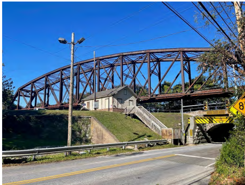
Whitford Bridge (127) and Whitford Station (126.01) (Commonwealth 2021).

Prior to the ascendance of commercial trucking, the Trenton Cutoff served as a major east-west corridor for the movement of freight. During World War I, U.S. Army troops camped in the meadow north of Whitford Station to protect the Whitford Bridge from sabotage.