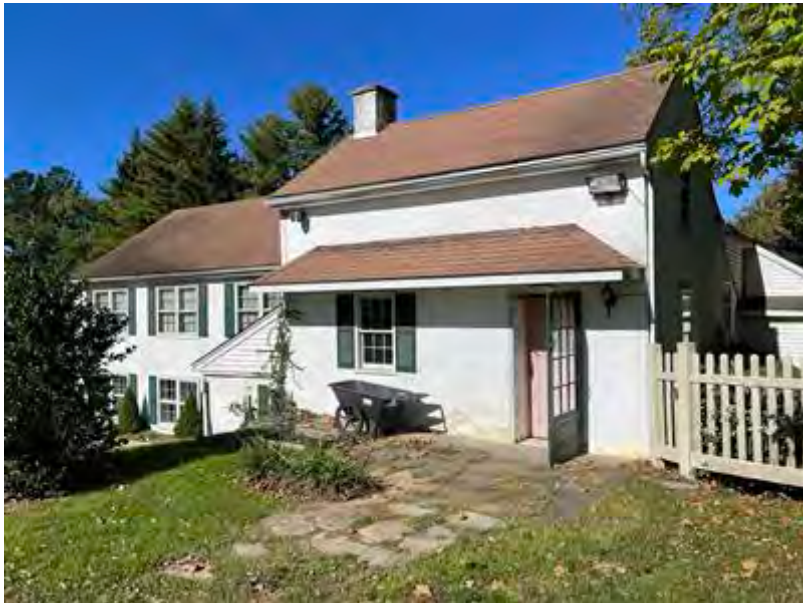
Office and Quarry Master's House (103.03) for Thomas Marble Quarry (Commonwealth 2021).