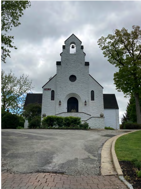
Chapel of the Atonement (025.07) at the Church Farm School (Commonwealth 2021).