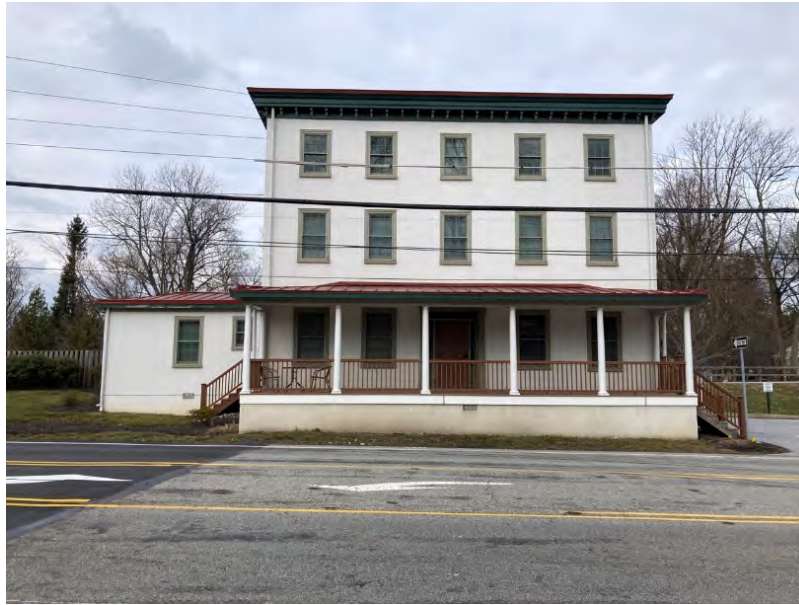
Exton Hotel (309) (Commonwealth 2020).

local residents, and favored by some, for its well- stocked supply of the bootleg variety.