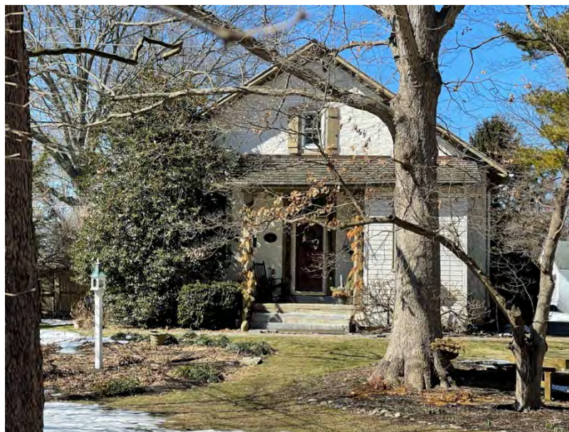
The Greenwood School (047), constructed in 1872 (Commonwealth 2021).